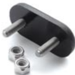
Back plate with stainless steel nut and bolts for direct attachment of tensioner to curtain.