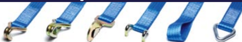
H30-0071 claw hook